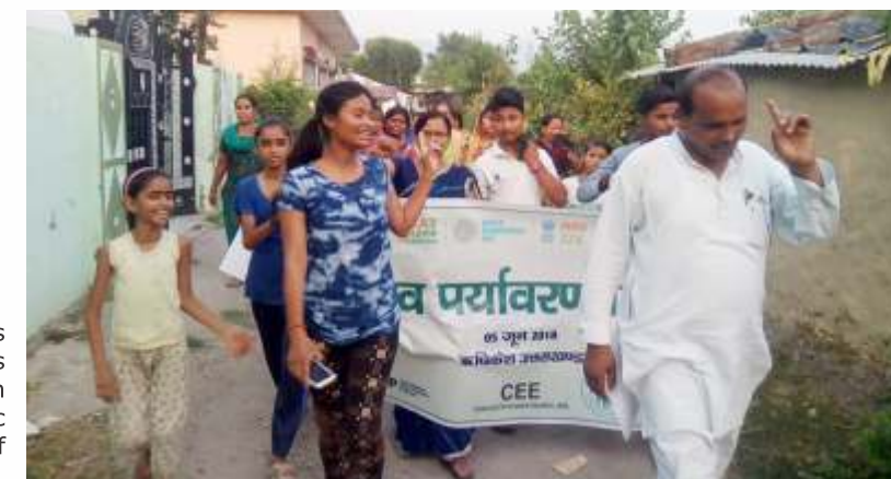
Community members initiated a rally across the streets of Rishikesh to sensitise the public about the ill-effects of Plastics.