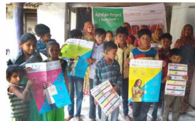
Barvala village, Jasdan and Fagas village, Kalawad, celebrated the occasion with various activities. A one day plastic free village campaign was also organised in collaboration with the local government bodies at Bhoyara and Vinchiya villages near Rajkot.