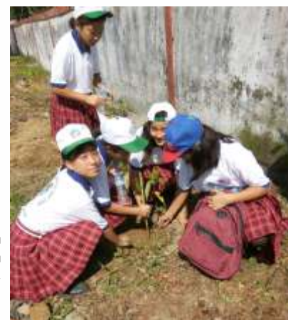
During the launch event, activities such as a plantation programme were conducted in which the students from Aburgellam Memorial School, Holy Cross School and Guardian Angel Residential School participated.