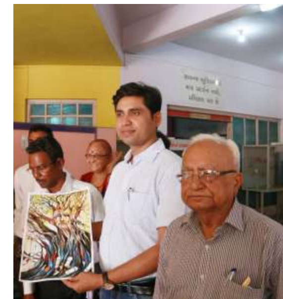
Dignitaries from GPCB and RMC acknowledging the painting competition winners.