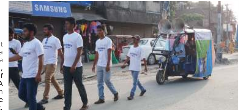
A cycle and walking rally was taken out by a total of 80 youths from Nehru Yuva Kendra and a local partner NGO. The rally covered about 3 km in Dhugguri, Jalpaiguri making pedestrians aware of the theme Beat Plastic Pollution . A mobile exhibition of posters with messages playing in Bangla on the same accompanied the rally throughout.