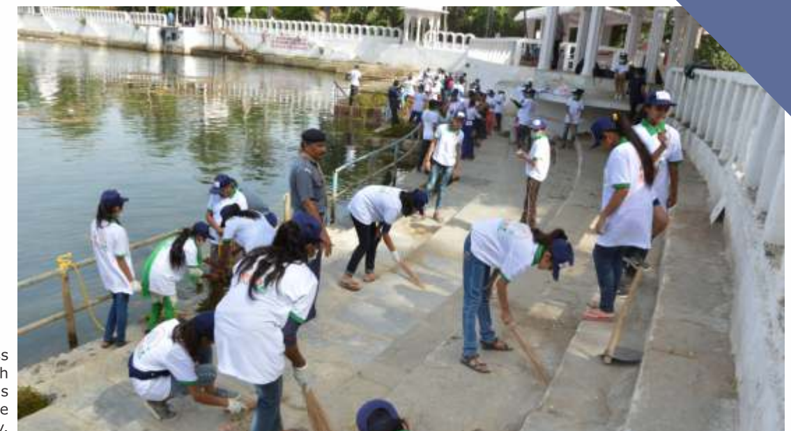
An open cleanliness drive at Doodh Talai, Udaipur was arranged by the youth of the city.

Major Stakeholders: Community members; school students and teachers; representatives from Rajasthan State Bharat Scouts and Guides, Swiss Agency for Development & Cooperation and Udaipur Municipal Corporation, State Environment Department, Rajasthan Pollution Control Board