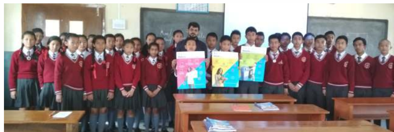
Interaction with the students enrolled under the National Cadet Corps (NCC) in St. Mary's Secondary School.