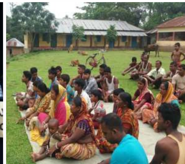
Programme on Community Awareness Udaipur, tripura