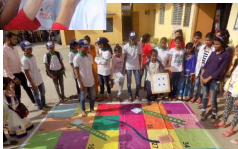
Activities like face painting, pledge writing and snakes & ladders were organised to sensitise children about the theme Beat Plastic Pollution at the Rajasthan State Bharat Scouts and Guides, Divisional Headquarter, Udaipur.