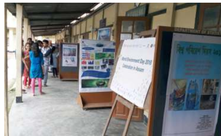
A poster making activity and quiz competition on Plastics was held at Pub-Kamrup College.