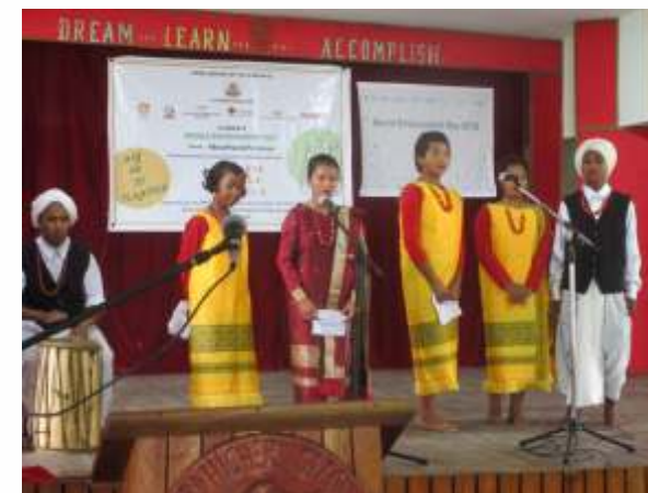
Students actively participated and performed in cultural events on the theme Beat Plastic Pollution at the Good Shepherd Higher Secondary School, Jongksha.