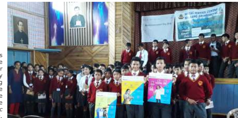
A discussion was held at Divine Saviour Higher Secondary School, Shillong to make students aware about the theme Beat Plastic Pollution .