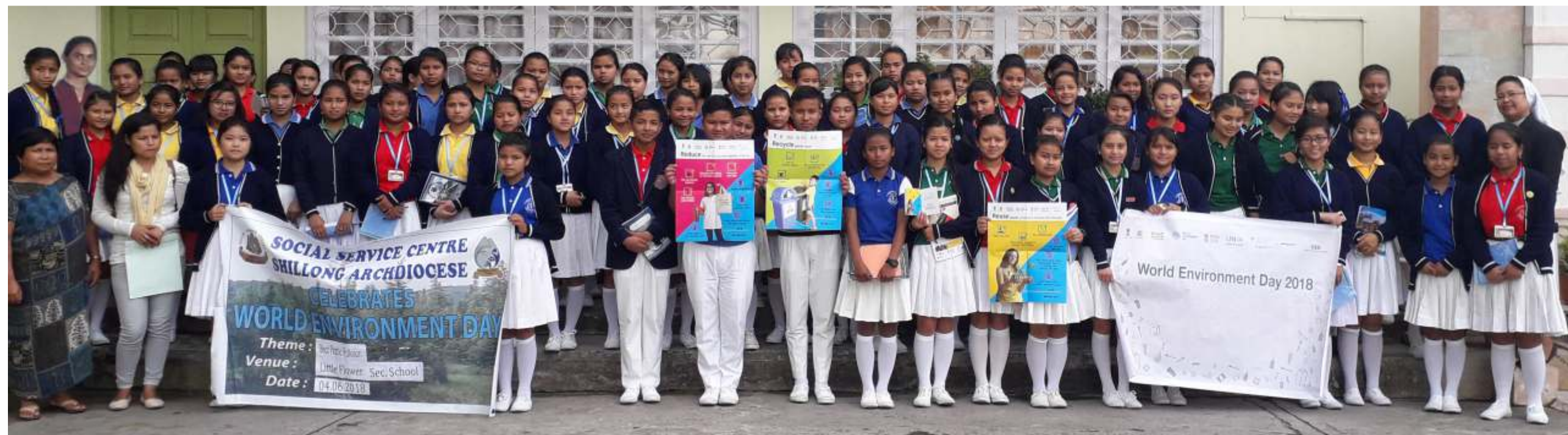
The importance of the theme Beat Plastic Pollution was explained to the students of Little Flower Senior Secondary School, Shillong.