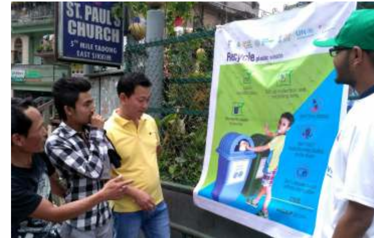
The concept of the 3Rs of Plastics was explained to the attendees of the Sunday service at St. Paul's Church.