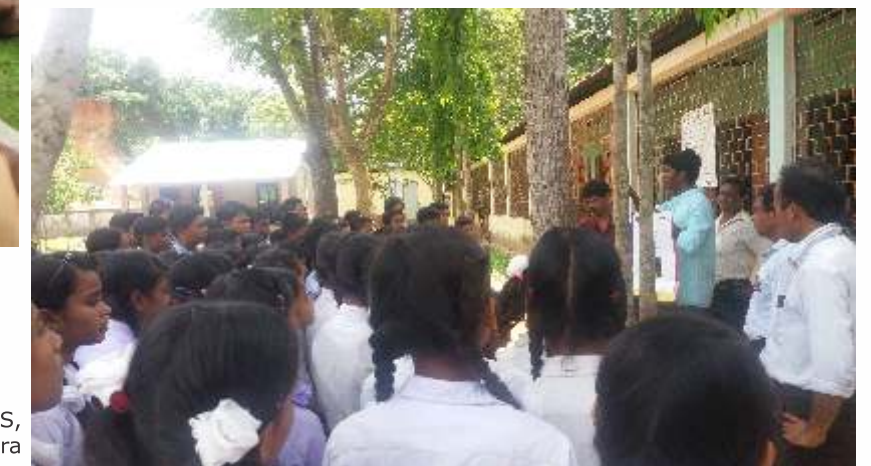
WED, 2018 celebration at Rani HS, Udaipur, Tripura