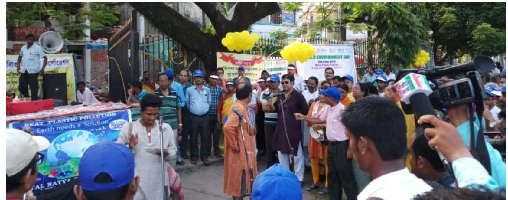
Post the tool kit launch, a street play and signature campaign were organised to sensitise the community people on the ill-effects of Plastics .