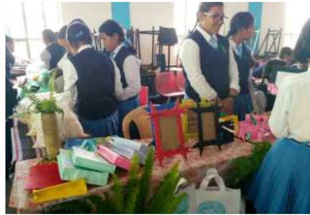
Students from Deorali Government Girls' Senior Secondary School, Gangtok presented an exhibition of recycled products.