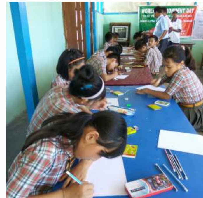
A standalone drawing competition on the theme Beat Plastic Pollution was conducted in the Little Flower School, Chimpu.