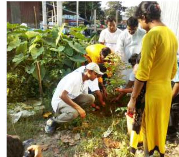
A plantation drive to raise awareness among citizens was carried out by the youth of Jalpaiguri Science and Nature Club in Bhopatty, Jalpaiguri.