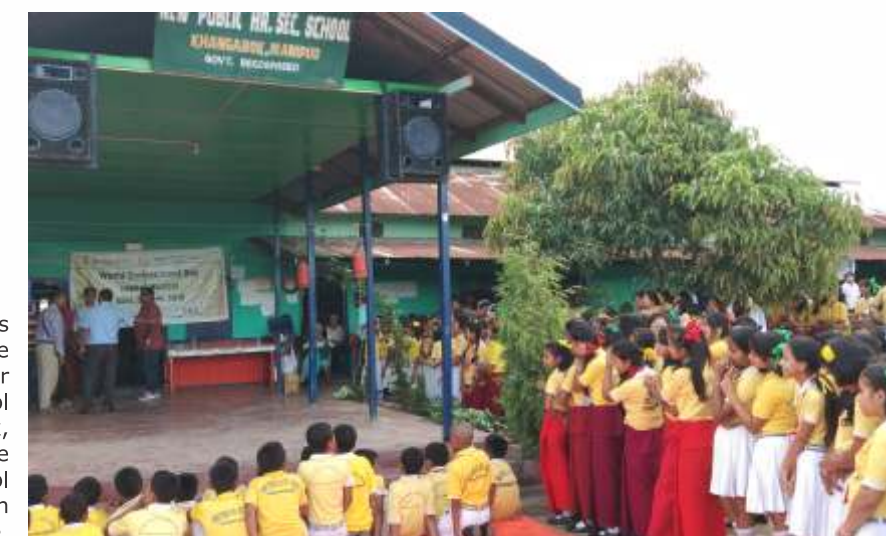
A street play was performed at the New Public Higher Secondary School in Khangabok, Thoubal with large number of school students in attendance.

Major Stakeholders: Community members, school and college students and teachers, representatives of All backward Classes & Economic Development Organization (ABCEDO) and District Child Protection Unit (DCPU), People's Art and Dramatic Association (PADA), NGOs like Zougam Institute for Community Resources & Development (ZICORD) and government officials