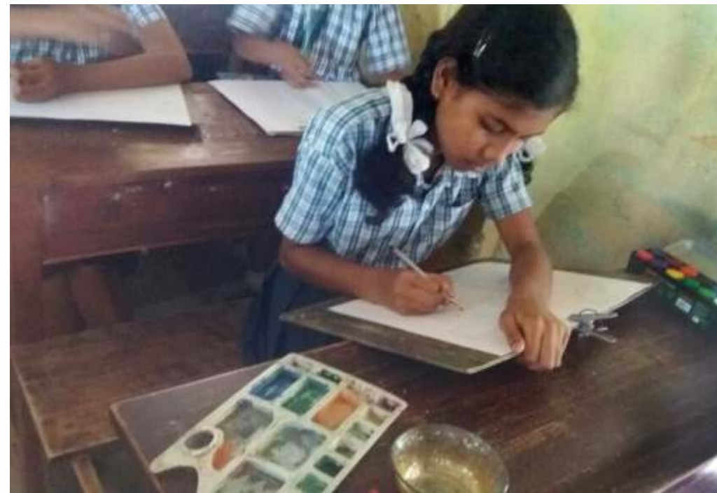
A painting competition was organised for the school students of Sadhutula Chandramohan Saha Uchha Balika Vidyalaya on the theme Beat Plastic Pollution .

Locations: Agartala and Udaipur Direct Reach-out: 1262 participants Activities: Launch of the tool kit on the 3R's of Plastics, interaction on beating plastic pollution, oath taking, extempore speech competition, painting competition, awareness talks, award ceremony, community interaction and quiz on plastics Major Stakeholders: Community members, school and college students and teachers, Tripura State Pollution Control Board and government officials