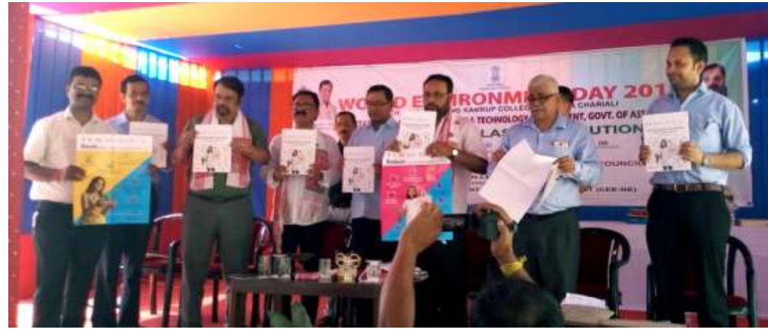
The Minister for Water Resources, Science and Technology & IT of Assam, Shri Keshab Mahanta launched the tool kit on the 3R's of Plastics at the state-level World Environment Day 2018 event organised at Pub-Kamrup College.