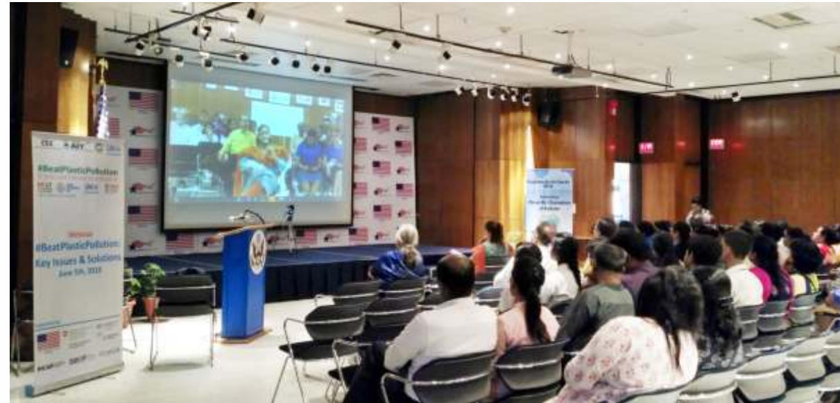
A webinar was held on the theme Beat Plastic Pollution with live interaction with experts from UN Environment, Osaka and Asian institute of Technology, Bangkok in the Lincoln Room, US Consulate General, Kolkata.