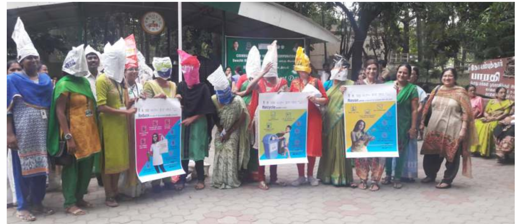
Residents and members of the Women's Association, Bharati Park, Ward 22, took a pledge against using plastics.