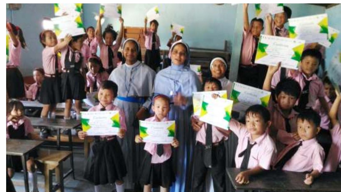
Certificates were given to the students who participated in the drawing competition held at St. Francis D'Assisi School Papumpara via Bunderdewa.