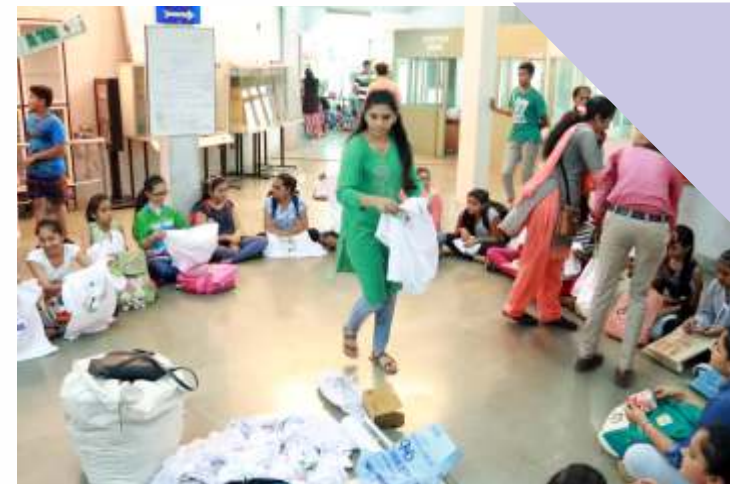
Volunteers facilitated the students in making cloth bags out of old t-shirts at O.V. Sheth Community Science Centre.