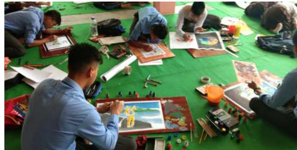
Students engrossed in expressing their thoughts on the theme Beat Plastic Pollution during a painting competition at the ABCEDO campus in Thoubal.