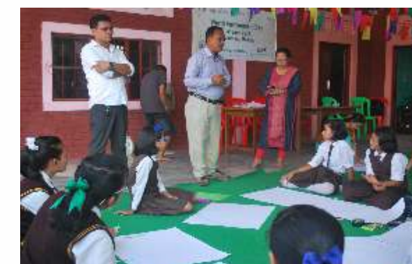
A drawing competition was held for the young children of the Juvenile Justice Home, Samaram, Thoubal District, along with an awareness session on the theme Beat Plastic Pollution .