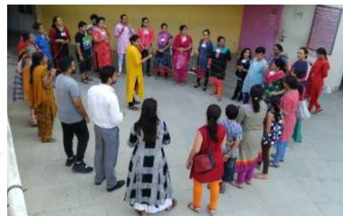
Understanding the concept of interdependence in nature through 'Web of Life' activity during the teachers' workshop at O.V. Sheth Community Science Centre.