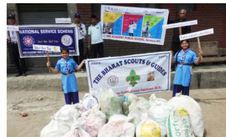
A total of 150 kg of plastic waste was collected by the students of HIM Academy Public School to be sent for road construction to the Shimla Municipal Corporation.