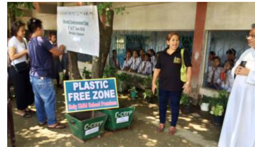
Holy Child School announced its campus as a Plastic Free Zone to mark the occasion.

Locations: Kohima and Dimapur Direct Reach-out: 2780 participants Activities: Launch of the tool kit on the 3R's of Plastics, interactions and cleanliness drives Major Stakeholders: Community members, school and college students as well as teachers, NGO representatives from Centre for Conservation of Environment and Rural Poor (C-cerp), Nagaland Pollution Control Board (NPCB), All Nagaland Private School Association (ANPSA) and government officials