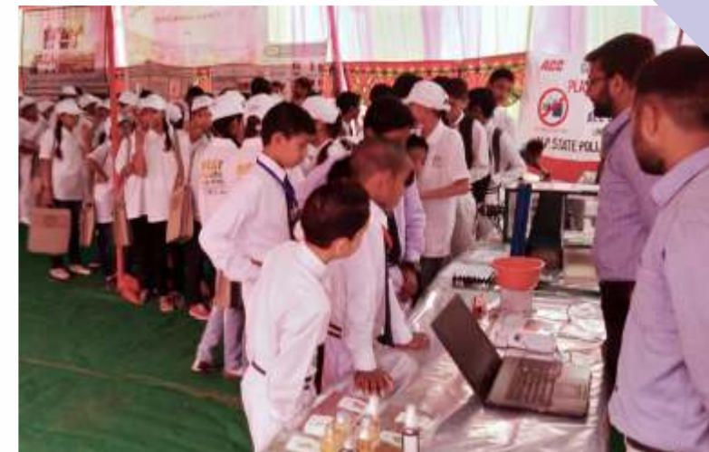
An open exhibition on recycled and reused plastic waste was held at Government Polytechnic College, Sundernagar, Mandi to help them understand the need of the 3Rs of Plastics.

Major Stakeholders: Citizens, NGOs, Himachal Pradesh Pollution Control Board (HPPCB), Mahila Mangal Dal and school students and teachers