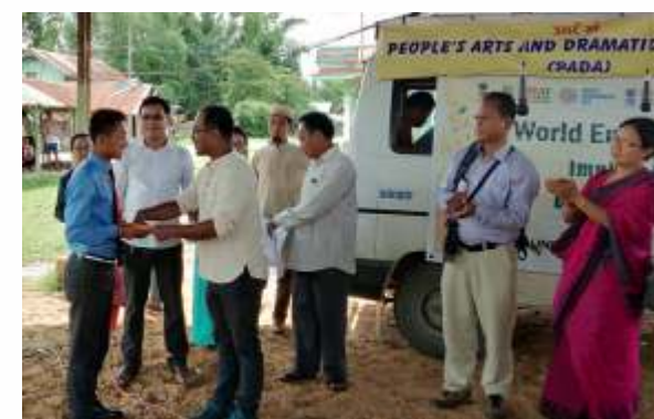
A prize distribution ceremony was held for the winners of the painting and essay writing competitions. Before this, a street play by People's Art and Dramatic Association (PADA) was also performed.