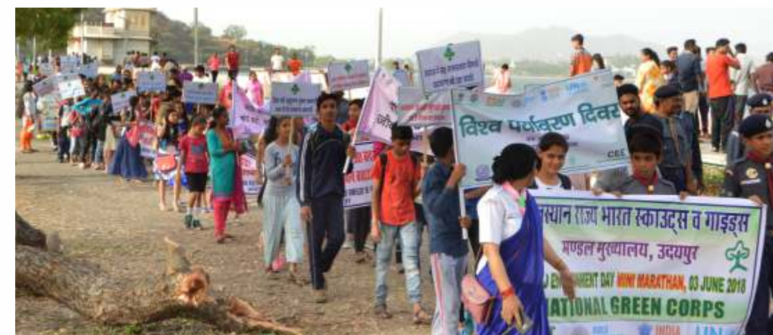
A Plasticathon, mini marathon, was held at Fateh Sagar, Udaipur. Students enthusiastically participated in the event to create awareness among community members about the theme Beat Plastic Pollution through placards and slogans.