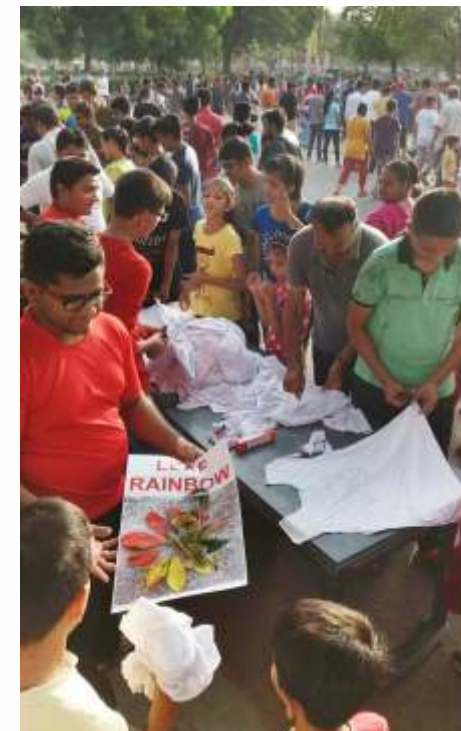
CEE team organised environmental games and activities at 'fun street' at Race Course.