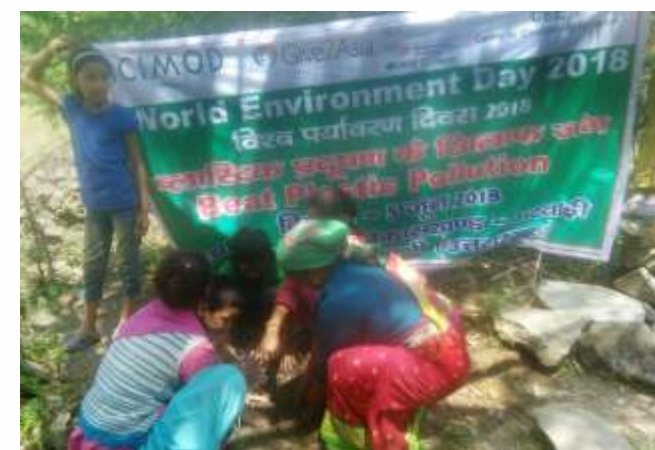
Local women actively participated in the plantation programme in Bhatwadi village, Uttarkashi.