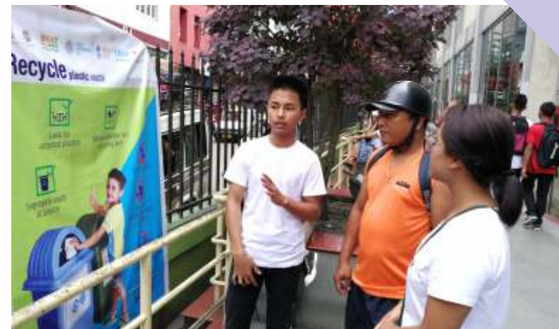
A banner presentation at the Millennium Mall, Aizawl, helped to engage the community on the theme Beat Plastic Pollution .