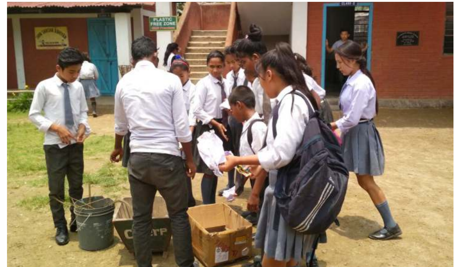
A cleanliness drive, in partnership with C-Cerp, was held at the Government High School, Naga Colony in Dimapur.