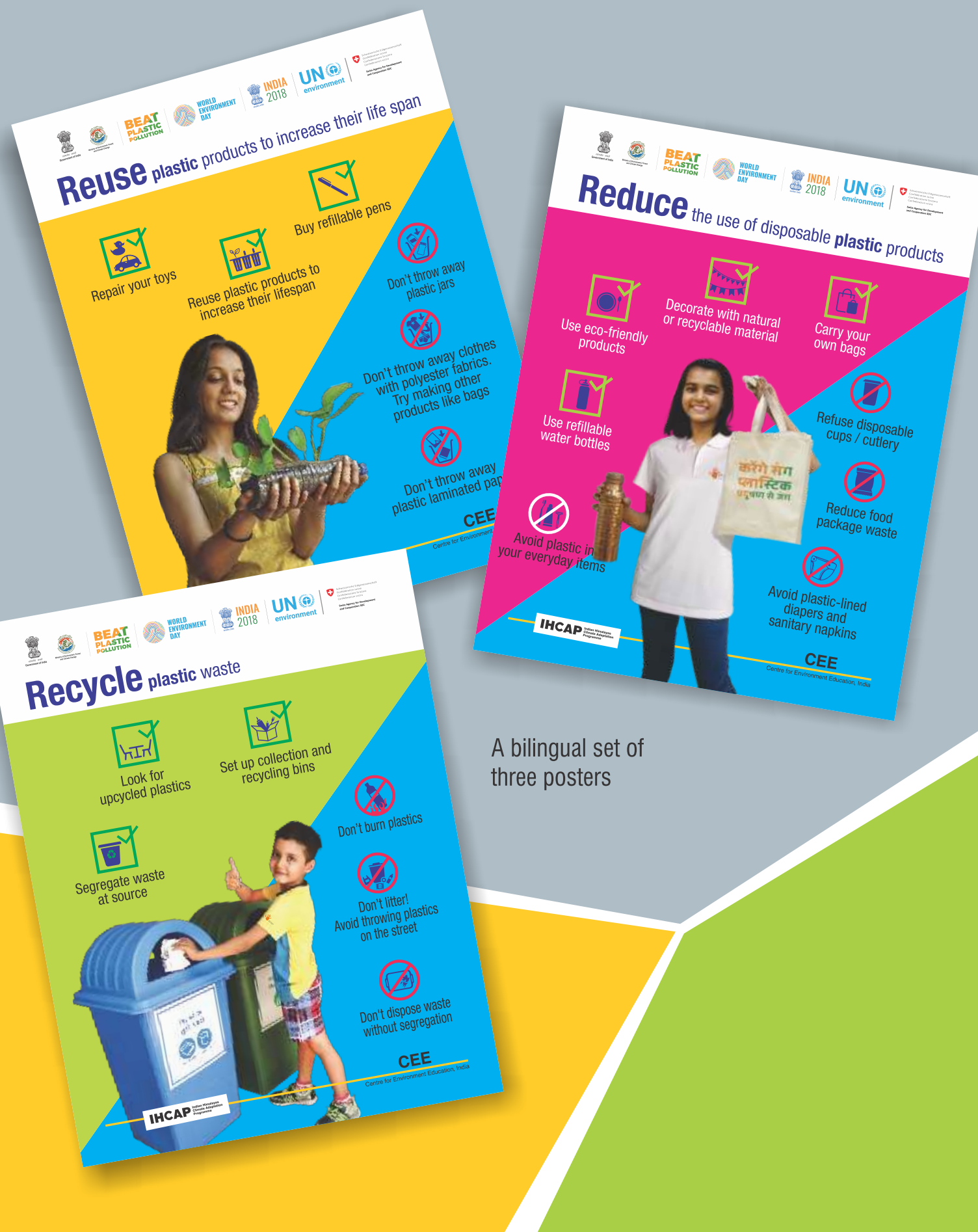
A bilingual set of three posters