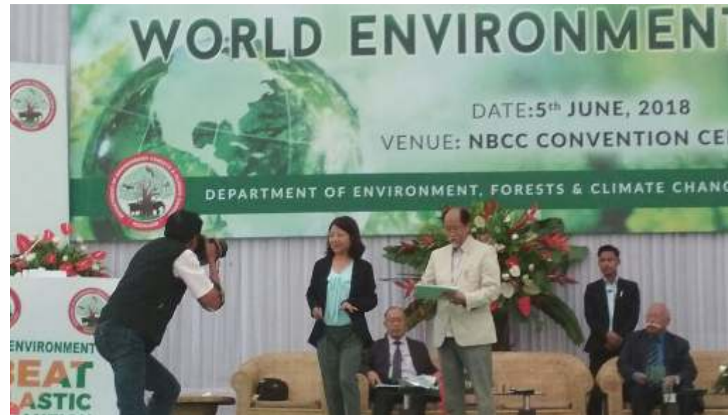
The tool kit on the 3Rs of Plastics was launched by the Honorable Chief Minister of Nagaland, Mr. Neiphiu Rio at the NBCC Convention Centre in Kohima.

Members of the National Green Corps (NGC) Eco Club were addressed by Mr. Bijoy Goswami, Programme Coordinator, CEE Ahmedabad on the theme Beat Plastic Pollution at the Little Flower Secondary School.