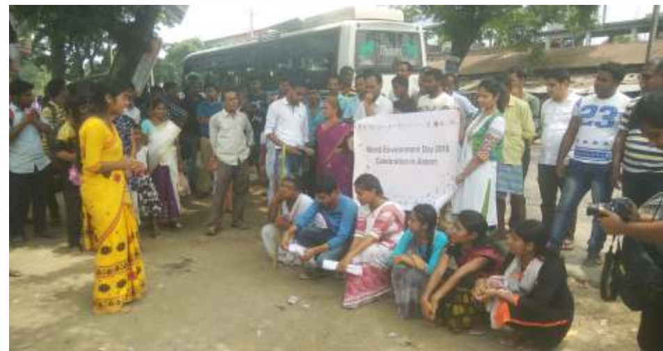
A street play on the theme Beat Plastic Pollution was also performed at the Bezera and Goreshwar Market, Puthimari, Baihata Tharili and Chandan Nagar, Six mile on the occasion.