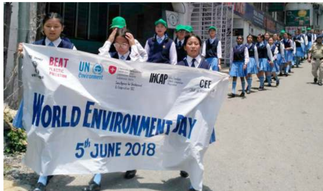
A rally was held from MG Marg to Deorali School to raise awareness about plastic pollution.