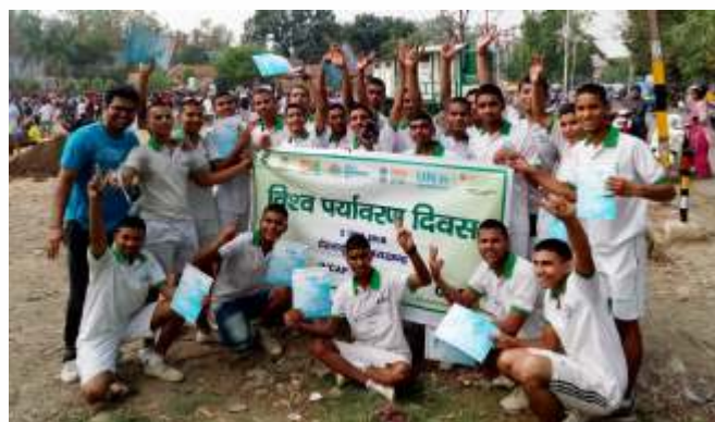
Students of Army School, Dehradun who successfully completed the marathon on the theme Beat Plastic Pollution .