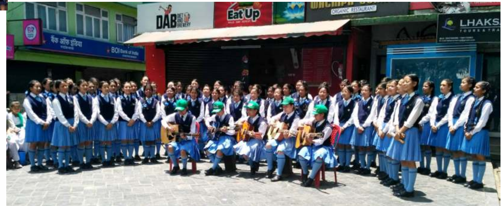
Students from Deorali Government Girl's Senior Secondary School held a concert at MG Marg, singing songs to raise awareness about environment conservation and beating plastic pollution.