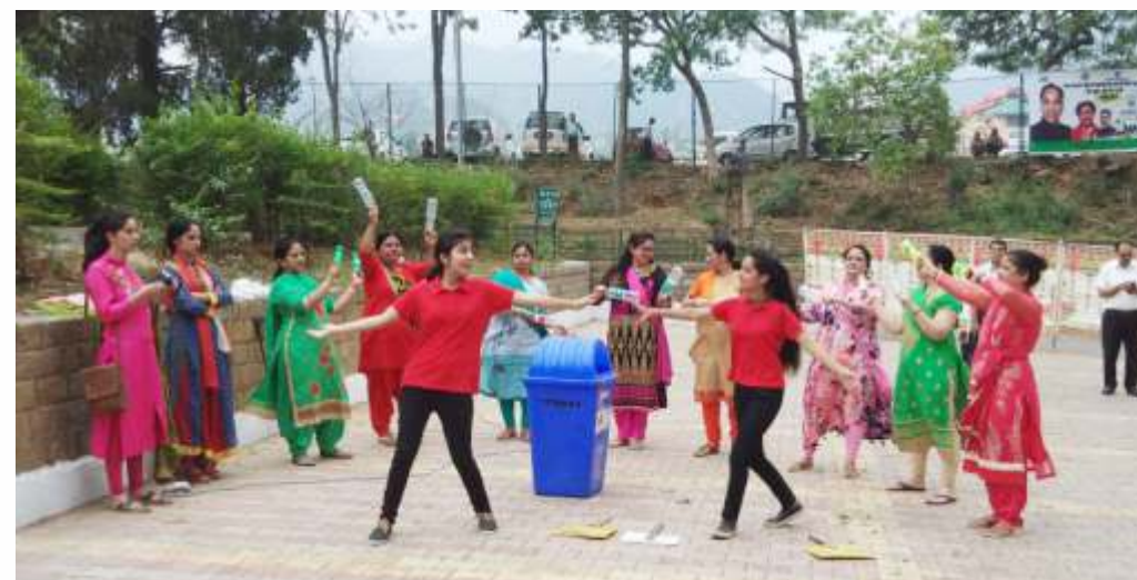
A skit and a dance performance to raise awareness among citizens regarding the proper disposal of plastics took place outside the Government Polytechnic College, Sundernagar, Mandi.