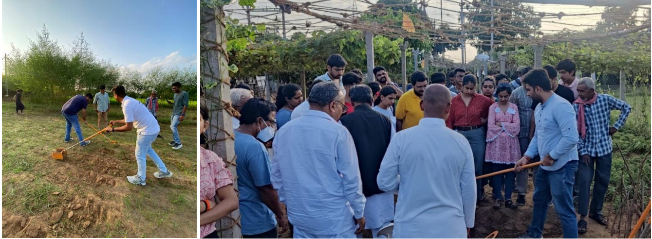
This concluded the activities planned out for day two of the conference.